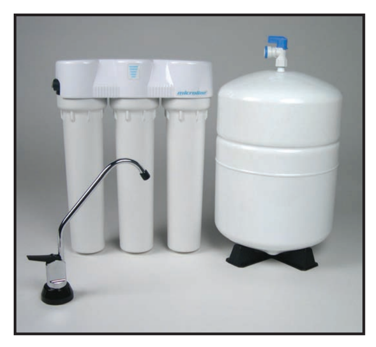
The "R.O." of the system is the secret.

"R.O." is Reverse Osmosis. This is the natural process which sets the foundation of R.O. systems. It may sound technical, but osmosis is a natural, organic phenomenon, a process that occurs in nature on a continuous basis. Vegetation, like trees, plants and flowers attain their nutrients by using osmosis to draw water from the soil.